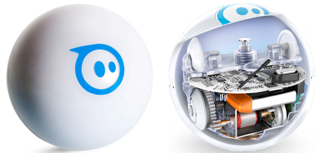
Figure 1. The Orbotix Sphero 2.0 remote-controlled mobile robot. Shown are its outer appearance (left) and inner workings (right).

advantage of the Arduino Robot over the Sphero is that additional sensors, such as a video camera, can be easily attached to the robot. The Sphero, on the other hand, can be used on a wider variety of terrains, including water, and may be easier to use as an actuator.