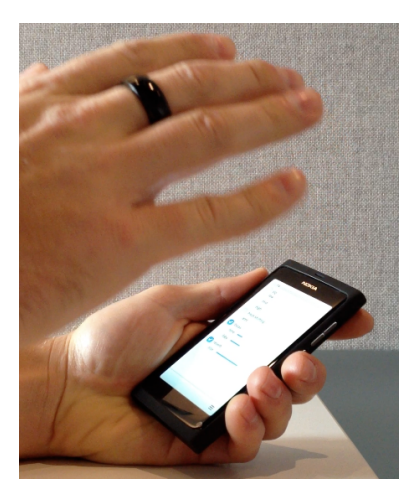
Figure 5: Interaction Using the Magnetic Ring

ing the magnetic field and allowing one to interact from a greater distance. The overall experience using the ring is similar to a theremin except that the user is free to select the axis of interaction and work with a much larger sound palette.