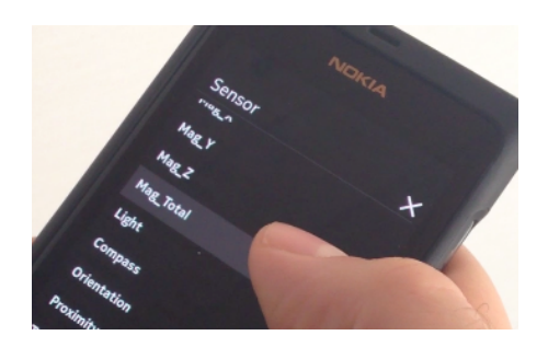
Figure 1: Selecting a Sensor

control and the previous mappings to that parameter will be removed. Figure 1 illustrates the selection of a sensor and Figure 2 shows several completed mappings.