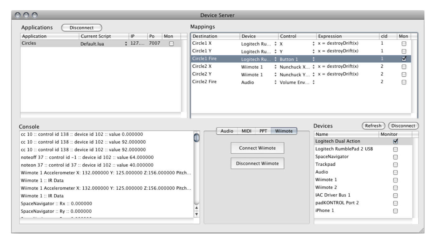
Figure 2: A screenshot of the Device Server GUI showing one client application connected to a variety of devices.

own encapsulated GUI for managing device connections. This is necessary for devices requiring Bluetooth pairing or other action sequences to establish connections.