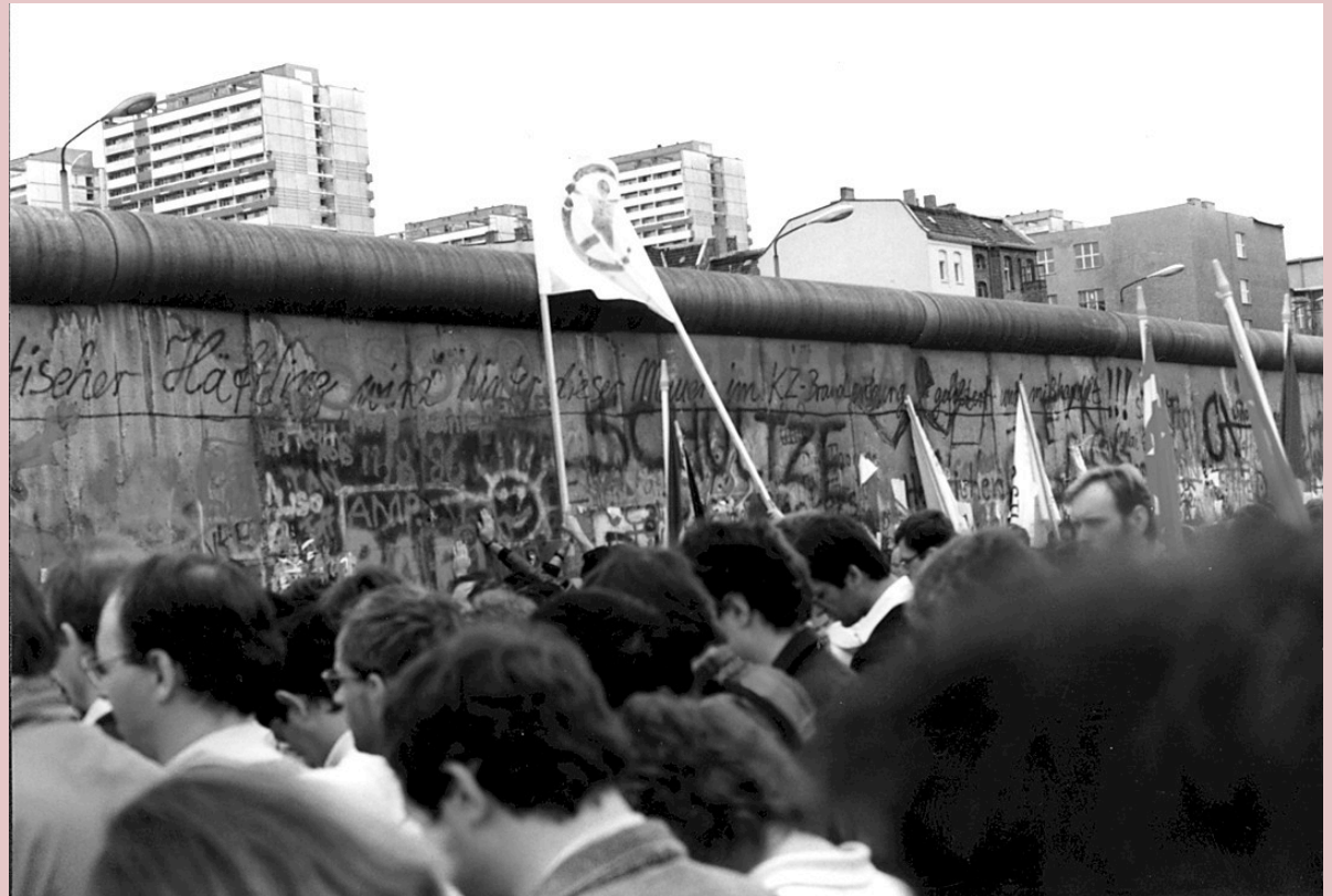
Berlin Wall, 1985

Basically, we forget or are masked from the real nature of things because we see through the lens of the camera.