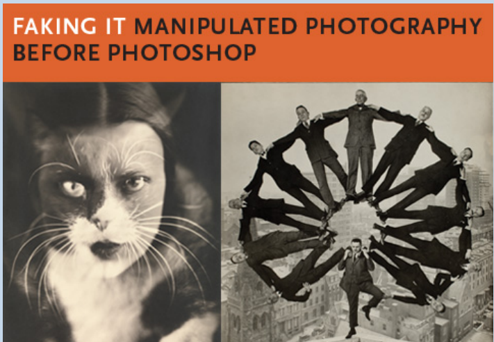
Photo manipulation from the 1840s to the 1990s through manual techniques