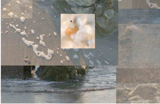
Figure 2. A screenshot from www.lovelyweather.com , “rock” node with “sand” foreground image.