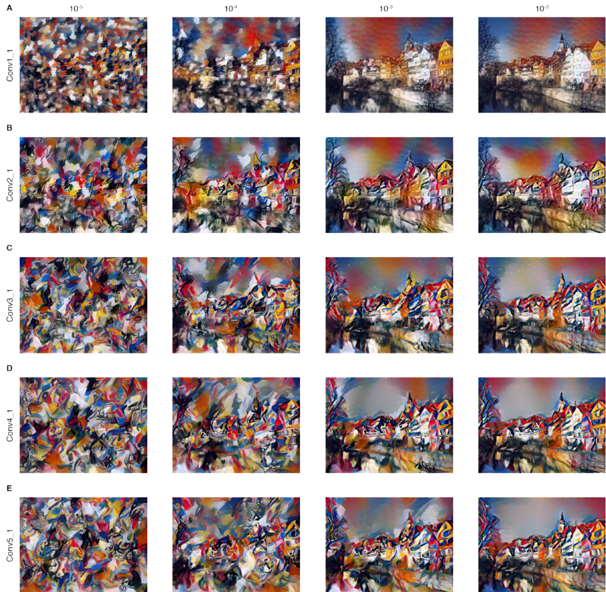
Figure 3: Detailed results for the style of the painting Composition VII by Wassily Kandinsky. The rows show the result of matching the style representation of increasing subsets of the CNN layers (see Methods). We find that the local image structures captured by the style representation increase in size and complexity when including style features from higher layers of the network. This can be explained by the increasing receptive field sizes and feature complexity along the network’s processing hierarchy. The columns show different relative weightings between the content and style reconstruction. The number above each column indicates the ratio \alpha/\beta between the emphasis on matching the content of the photograph and the style of the artwork (see Methods).