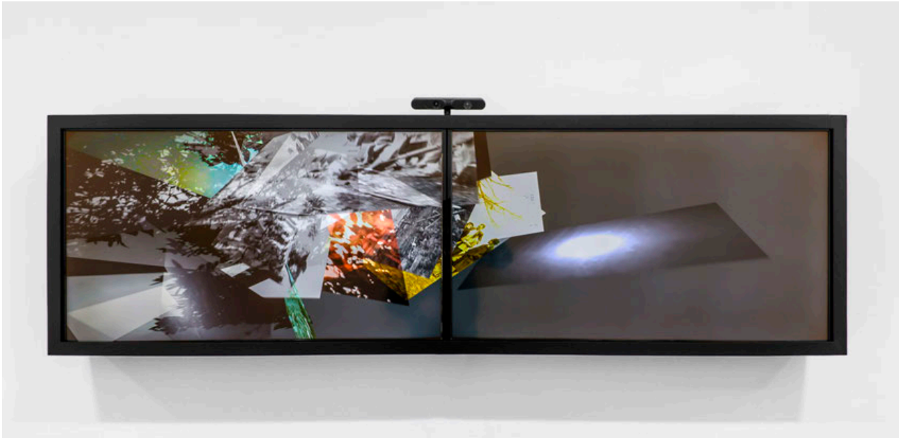
George Legrady (b.1950) Anamorphic Fluid , 2015

Dynamic visualization featured on LED screens or projection with custom software, computer with Kinect camera Dimensions variable (video image constantly changes in real time) GLEGR282