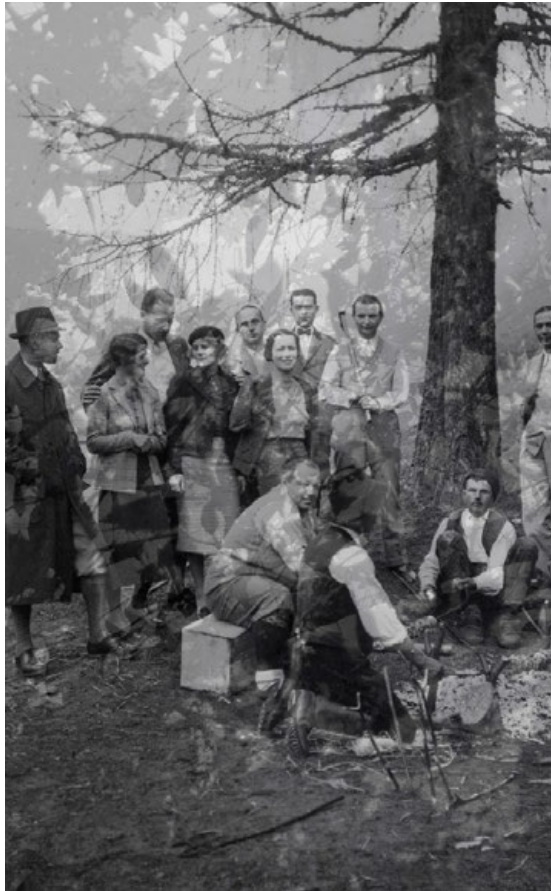
George Legrady (b.1950) Day & Night Cookout, 2015 1

Lenticular photographic print mounted on honeycomb aluminum 75 x 47 in. GLEGR275