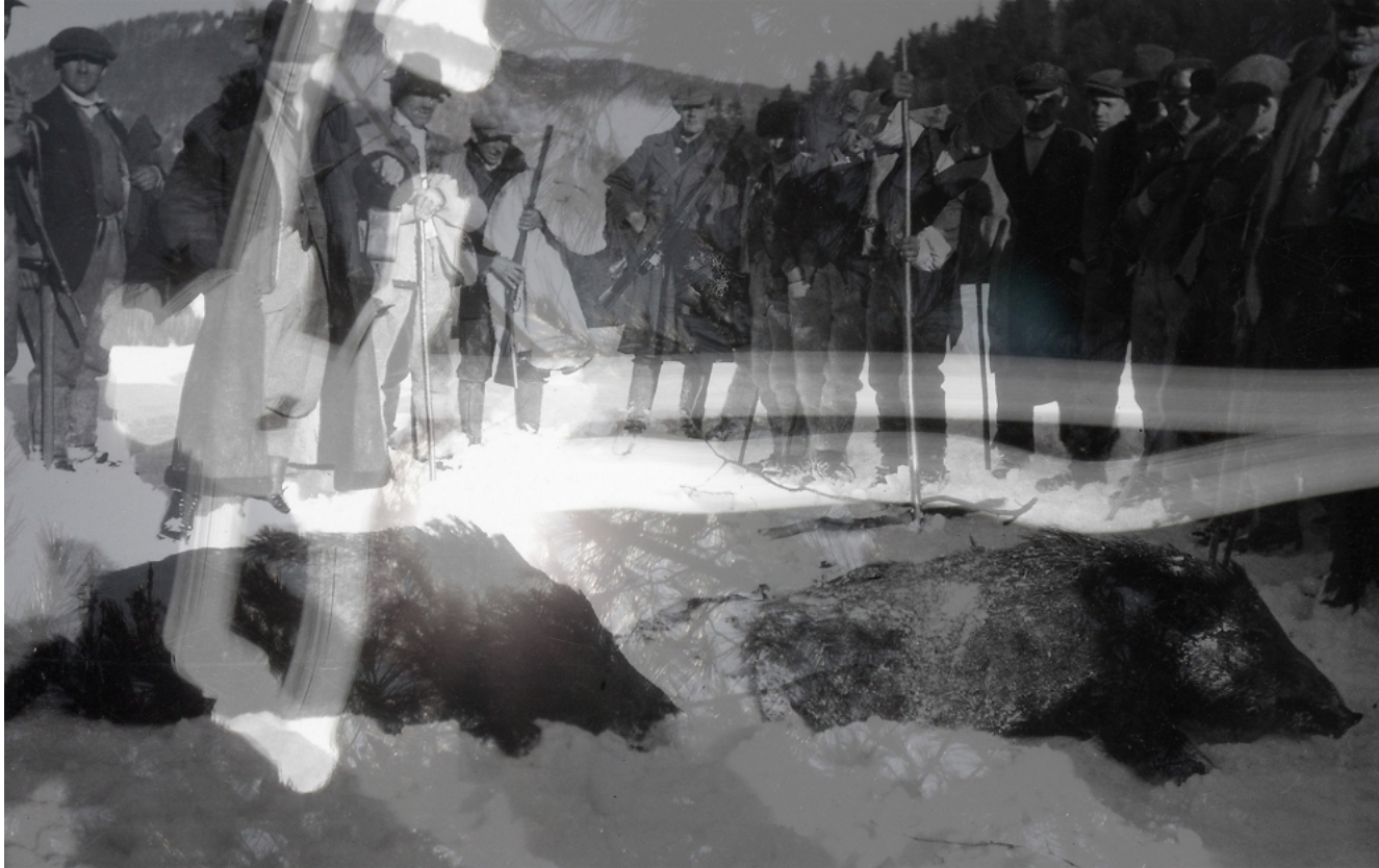
George Legrady (b.1950) Day & Night Transylvania Hunt, 2015 1 Lenticular photographic print mounted on honeycomb aluminum 60 x 95 in. GLEGR273