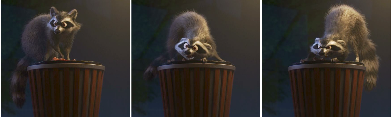
Figure 1: A skin simulation was performed on this fast-moving raccoon during a key fight scene. The kinematic mesh, particularly the hind legs and the torso, contains frequent self-intersections that cause problems with previous approaches.